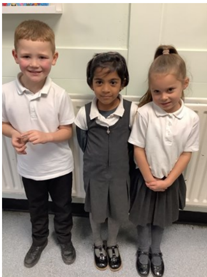
Congratulations to the winners of our reading raffle!