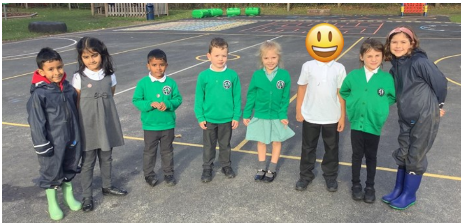
Meet our new Reading Champions!